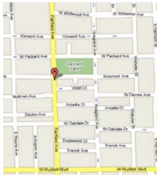
Map to Casa D'Agelo 3402 Fairfield Ave.

Next Board Meeting: Dec. 12, 7:30 PM All members are encouraged to attend.