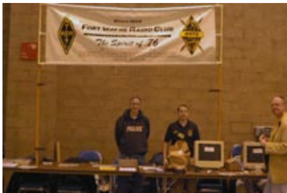
Fort Wayne Radio Club table