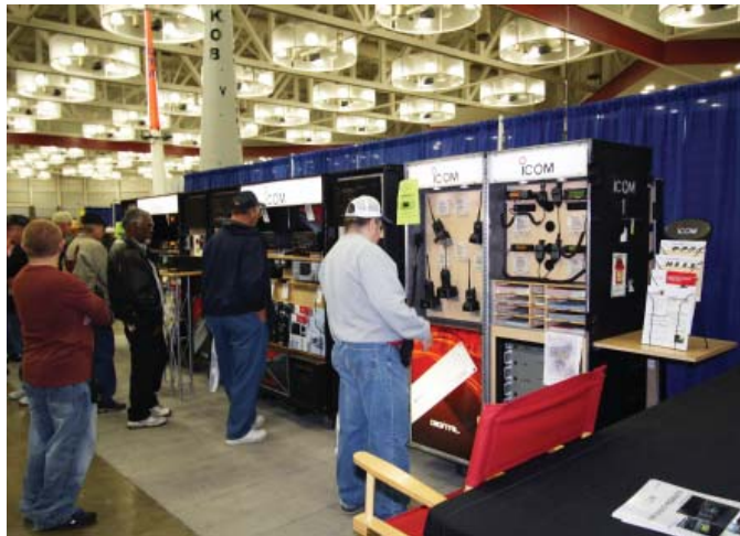
Photos from the 2011 Fort Wayne Hamfest. More on Page 9.