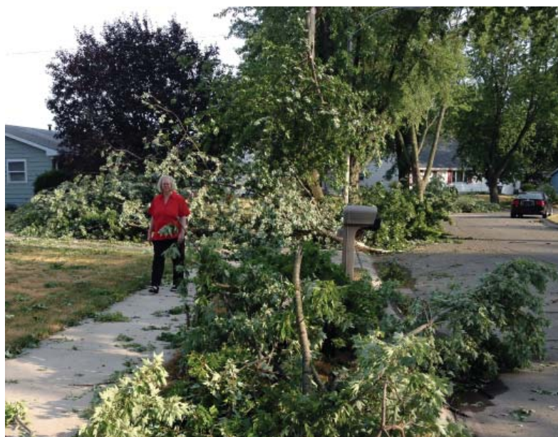
After the storm had passed, my wife and I walked around our neighborhood. This is typical of what we saw. Compared to this, our yard had very little damage.