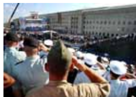
In Remembrance, 9/11/2001